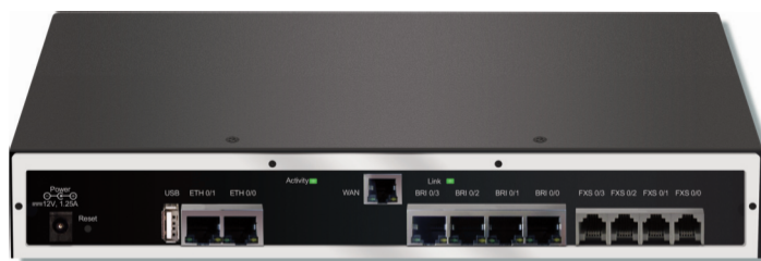
Integrated Access Device (IAD)