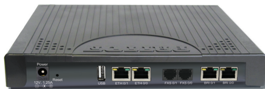
Enterprise Session Border Controller (eSBC)